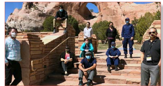
NEC hosts CDC Epi-Aid team to assist with COVID-19 surveillance and case tracking systems for better disease characterization.

The Navajo Epidemiology Center (NEC) is playing a critical role in assisting with making data-driven decisions by collecting and analyzing data, and using them to develop appropriate strategies and activities for COVID-19 response on the Navajo Nation. NEC is working with partners (tribal programs, IHS, 638 tribal organizations, state health departments, academic institutions, non-profit programs, and CDC), to conduct COVID-19 disease surveillance, perform contact tracing, and manage the data to help with data visualization. NEC also shares its daily COVID-19 situational awareness reports with leaders, partners and general public to help with making informed decisions. Additional information can be found at: www.ndoh.navajo-nsn.gov/COVID-19 .