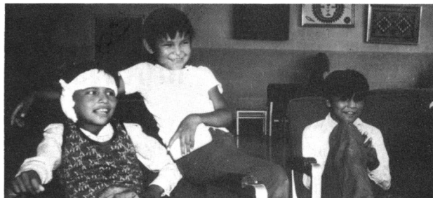
The Tuba City Boarding School provides a pleasant atmosphere for convalescing post-operative patients

gist's visit. Also, when the hospital operating room personnel were assisting with tympanoplasties, other needed surgery had to be postponed—the hospital had only one anesthetist, one scrub nurse, and one circulating nurse.